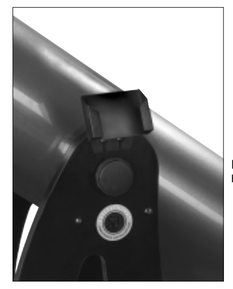
Figure 2. The controller holster installed.

Once the holster is installed, simply place the hand control into the holster, making certain that the cord does not get caught between the controller and the holster. You can leave the cord attached, and can even press the controller's buttons while it is in the holster. You may even find it convenient to simply leave the hand controller in the holster all the time. Be certain to remove and disconnect the hand controller before separating the telescope sections or moving the telescope.